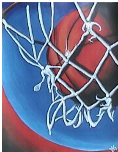
Jillian Leedy (Illustration)