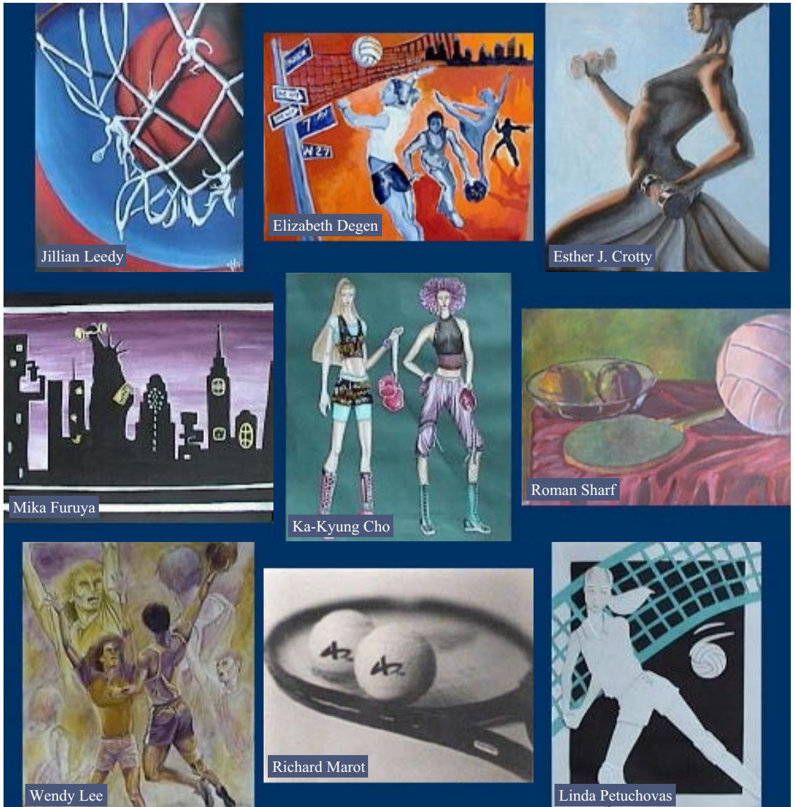
Entries are now on display in the Health and Fitness Art Gallery and at http://www3.fitnyc.edu/healthandphysicaleducation/ .